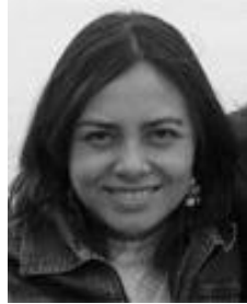
Sofia - Colombia