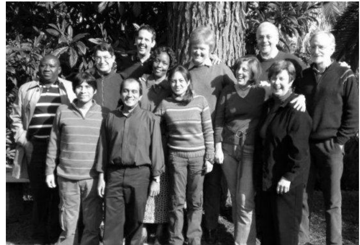
World ExCo meeting 2010

Management of Accounts and Finances of World CLC