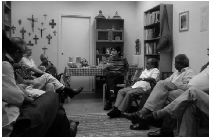
Meeting of new Jesuit Provincials at CLC office - Apr 2011

The office is physically located on the campus of the General Curia of Society of Jesus