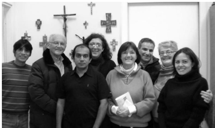
CLC Office Team and Euroteam

Provision of material and human resources for formation and special needs