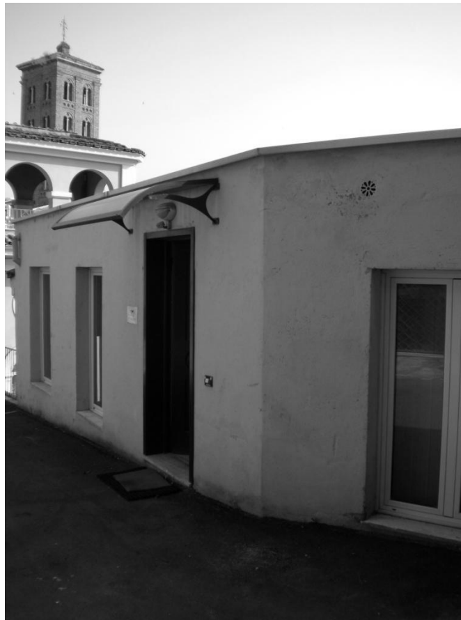
Entrance of current CLC Office

One of the most expensive items in the annual budget has been the cost of renting an apartment for the Executive Secretary in Rome