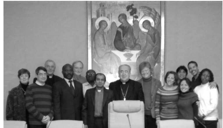
World ExCo meeting 2010 with Cardinal Stanislaw Rylko, President of Pontifical Council for The Laity