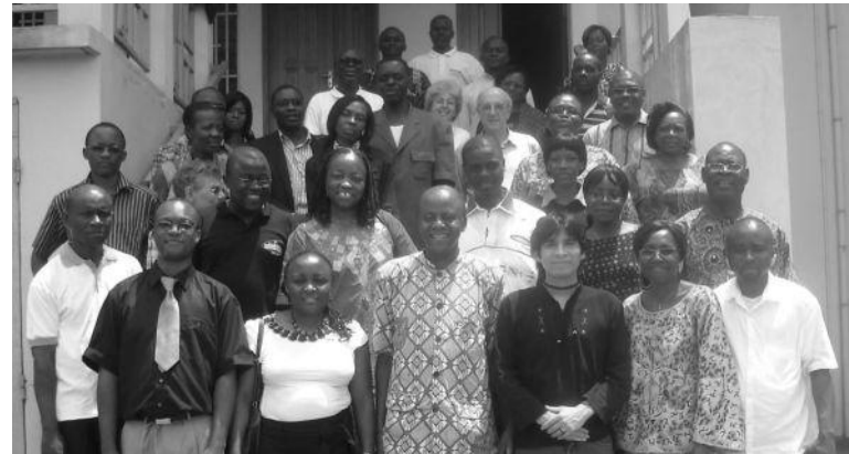
CLC Cameroun Assembly 2011

Keeping contact with national communities, offering support and guidelines, following national processes, visiting communities ... and supporting and coordinating CLC international events