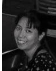
Van - Vietnam Italy

The Secretariat in Rome is the only full time structure that the World CLC has at its service.