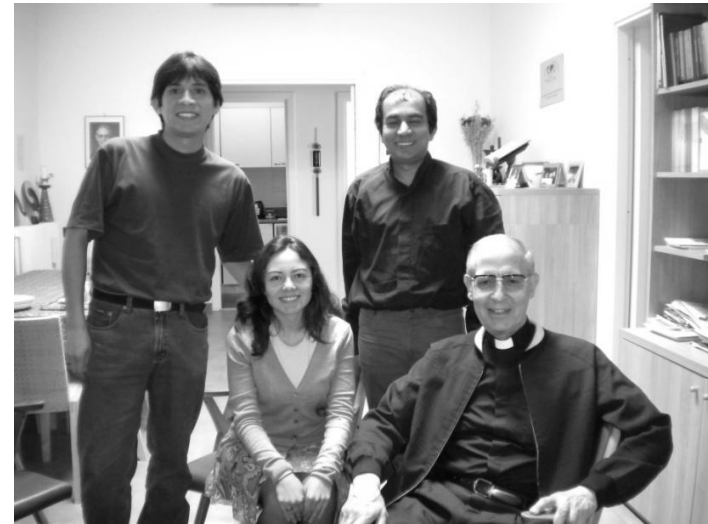
CLC Office Team and Fr. Adolfo Nicolas sj, Superior General of the Jesuits, and CLC World Ecclesiastical Assistant

Rome is a central route for CLCers who are travelling. Personal contact creates and deepens the sense of a World Community