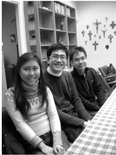
CLCers from Hong Kong – Christmas 2010 at CLC office

You, and hundreds of other members of CLC from all over the world, are very welcome to visit !!!