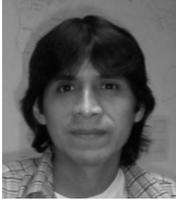
Franklin - Peru