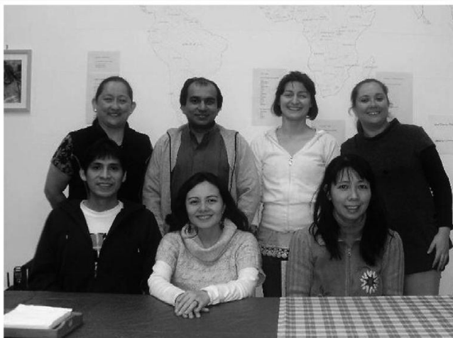
CLC Office Team and CLC friends